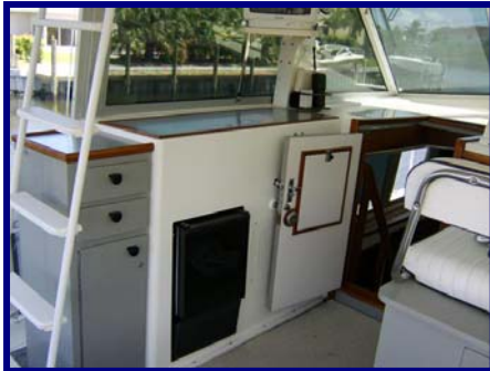
Full Wet Bar

The fully enclosed wheelhouse features the lower helm station, custom bench seating which stores 8 man Zodiac life raft, Large sofa to aft, hi-low cocktail with seating for 4, new Plexiglass wing doors, stereo speakers, icemaker, full wet bar and custom cabinetry to hold liquor and glasses safely.