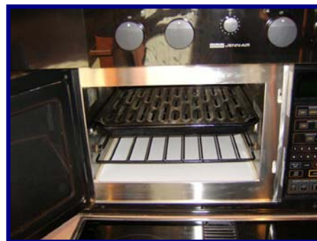
GE Microwave/ Convection Oven