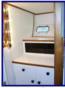
Vanity And Storage