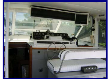
Lower Helm Station