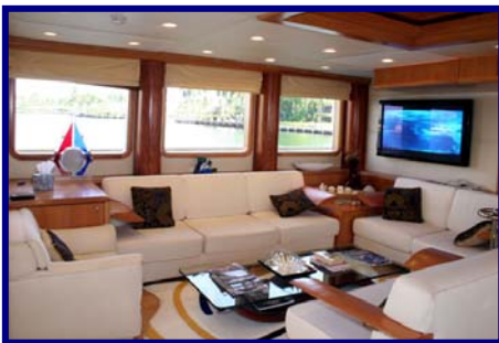
Salon Seating / Media Area

The spacious interior features Swiss Pear hardwood flooring and accent cabinetry along with African Rosewood entertainment bar and polished stainless steel electrically operated sliding door entries to the main salon and flybridge. The main salon entertainment center features a 50" Mitsubishi plasma flat screen TV with worldwide satellite reception and a Bose Lifestyle stereo music center. There is a Retro-Projector in the Main Salon with a Laser Video Player. The main salon interior overhead is accented with off-white silk linen headliner and features sculptured hardwood joinery as a central focal point with recessed mood lighting throughout. The main salon bulkheads are contrasting Swiss Pear and African Rosewood hardwoods and veneers with light African Rosewood plank flooring and dark African Rosewood pillars. A full width Master Suite, two VIP suites and two double cabin suites along with two cabins for crew complete the accommodations.