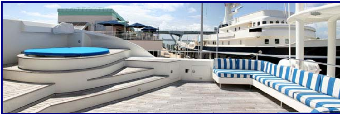
Flybridge / Jacuzzi / Sun Deck

The handsome tri-platform radar arch is affixed aft on the bridge deck with attached satellite antenna, sat-com antenna, two radar arrays, GPS antennas, VHF radio and SSB antennas. The aft bridge deck is composite fiberglass with planked teak overlay. There are polished stainless steel stanchions with teak rails all around the bridge deck extending forward to the cabin-top super structure.