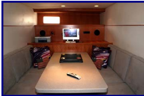
Crew Dining Area