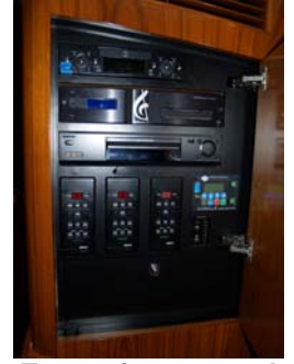
Entertainment and AC Controls