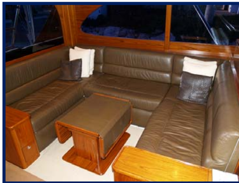
Port Aft Salon Settee

Further aft to starboard is the concealed bar which has a sink, icemaker, electric liquor dispenser, and a concealed 42" plasma TV that pops up. Opposite this area is a very large leather covered "U" shaped lounge with rod storage under. The salon is paneled in the satin finished matched teak that Rybovich is famous for and all trim is teak as well. The head sinks and vanities are all hand carved mahogany and all the counter tops in the salon are stone with fossilized fish. The flooring is all custom teak and holly and all seating surfaces are leather. There are 18 drawers in the salon alone and every available inch of space is utilized for storage. Aft to the fishing cockpit which has mezzanine seating that is cooled by an overhead air conditioning vent. The cockpit has 182 square feet of space and is rigged for serious fishing.