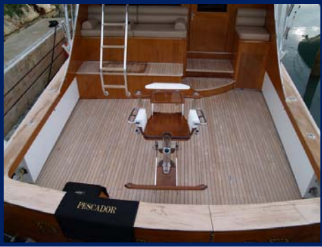
Release Fighting Chair