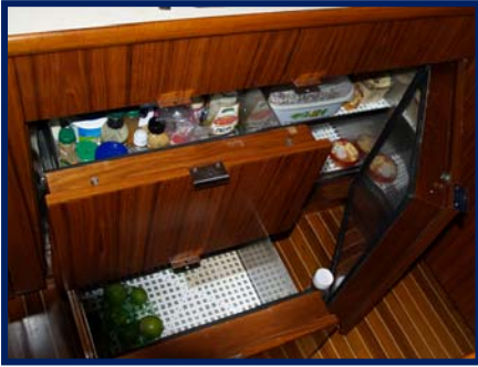
Sub Zero Drawer Refrigeration and Freezer