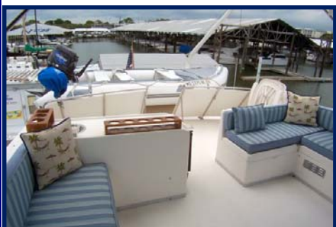
13' Avon w/ 30 HP Tohatsu