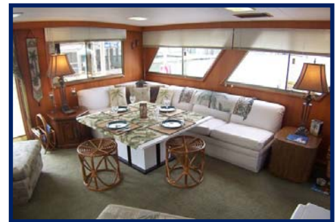
Salon Table Converts to Dining