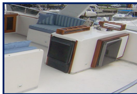
Bridge Wet Bar