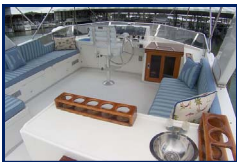
Bridge Looking Forward